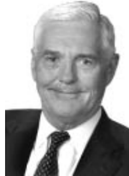
Robert Lutz Vice Chairman General Motors

Learn how other Detroit business leaders are playing the innovation game to win at this year's Broad Executive Forum – featuring renowned product innovator Robert Lutz, General Motor's vice chairman of Product Development and North American chairman of Operations.